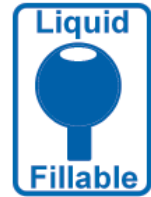
Type 232.50 - Dry case Type 233.50 - Liquid filled case

The WIKA Type 23X.50 gauge offers a large dial, making it ideal to be read from a distance. The stainless steel wetted parts and case construction ensures a long service life in harsh applications. This gauge is used for chemical, oil exploration and production, power generation, and other applications requiring long lasting instrumentation.